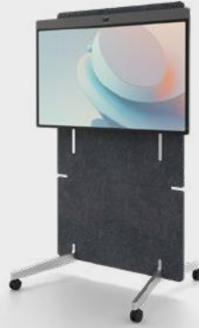
Neat Board 50 (with adaptive stand)