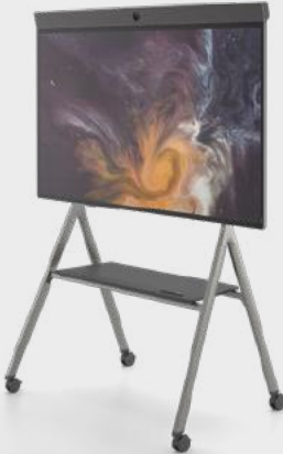
Neat Board (with floor stand)