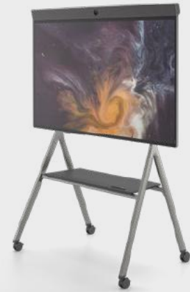
Neat Board (with floor stand)