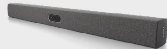
Neat Bar Pro