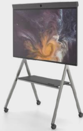
Neat Board (with floor stand)