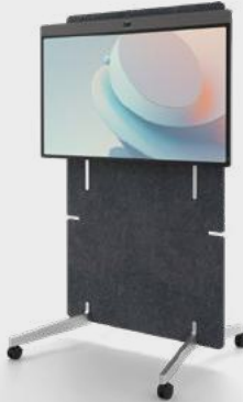
Neat Board 50 (with adaptive stand)