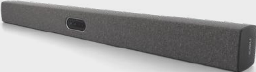
Neat Bar Pro