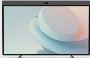
Neat Board 50