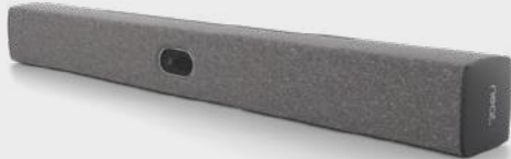
Neat Bar 2