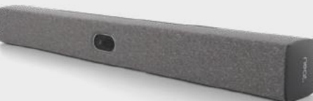
Neat Bar 2