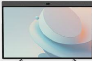
Neat Board 50