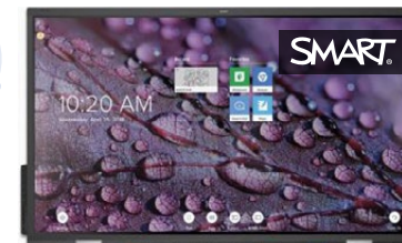
86" - SMASBID7286RP