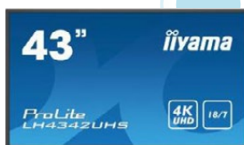
43" - IYLCD4342UHS