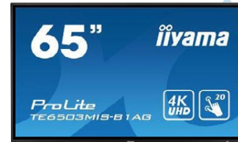
65" - IITYE6503B1AG