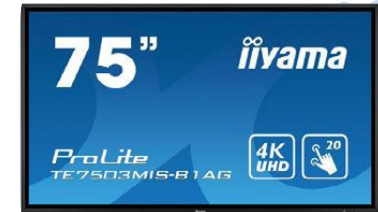
75" - IITYE7503B1AG