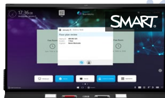
65" - SMASBID6265SP