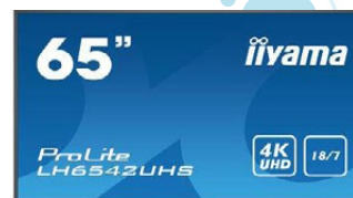
65" - IYLCD6542UHS