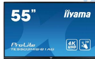
55" - IITYE5503B1AG