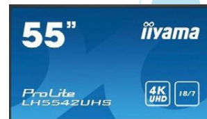
55" - IYLCD5542UHS