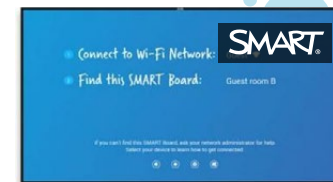
75" - SMASBD2075P